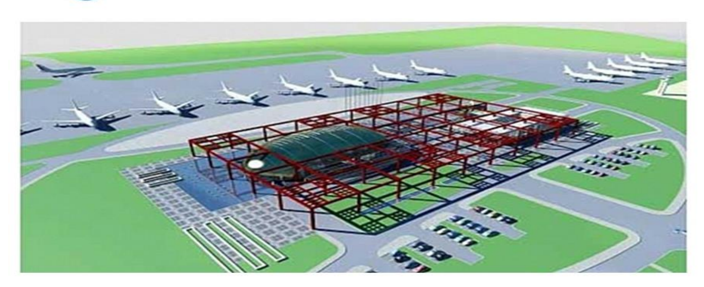
❖ Bangabandhu Sheikh Mujib International Airport