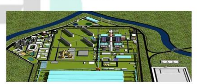
Matarbari Ultra Super Critical Coal-Fired Power Project

Design and Construction Service for the Hazrat Shahjalal International Airport Expansion